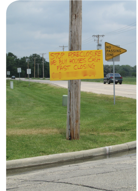
Signs may block motorists' vision, causing unsafe conditions.